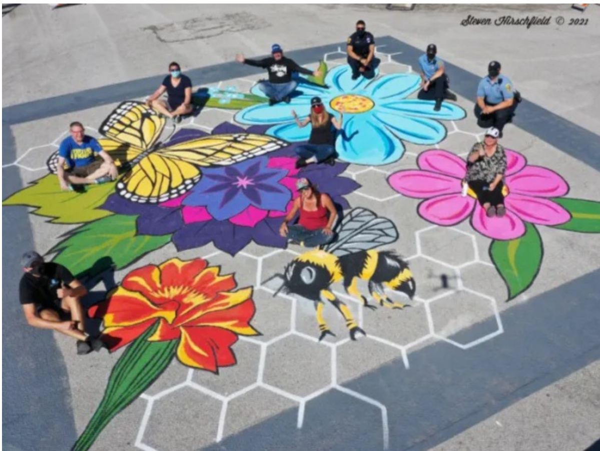
Artist and volunteers celebrating their new artwork in the City of Clearwater

Scenic Intersection Murals: "City of Clearwater sponsoring paint the pavement placemaking project in the Skycrest neighborhood"