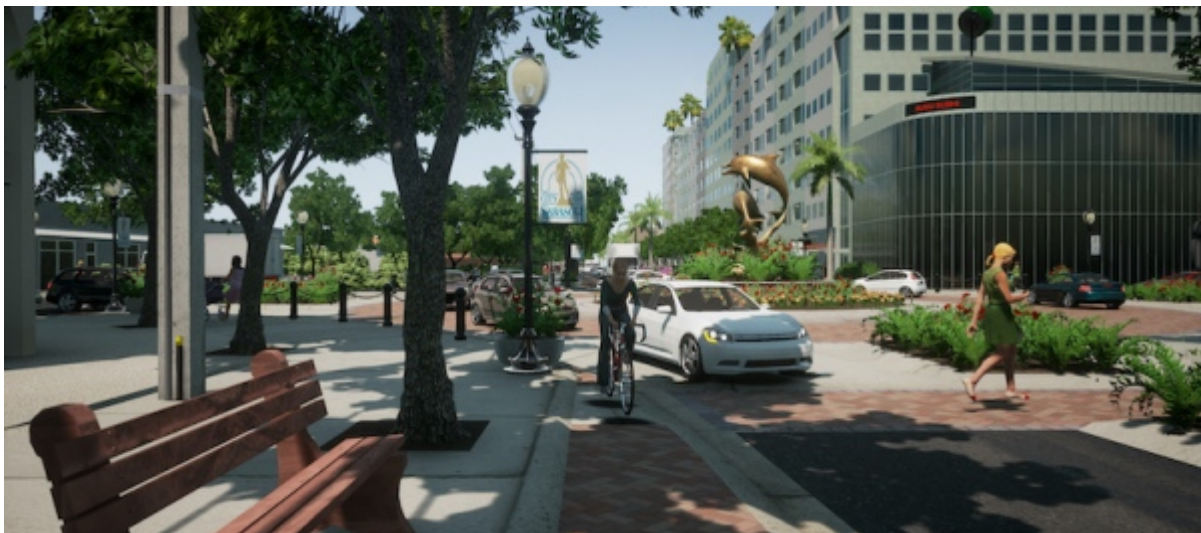
To help a skeptical public understand what it would get in return for giving up the two travel lanes, Sarasota-based Hoyt Architects Lab created a rendering depicting how different the three intersections could look with marine-themed public art in the roundabout central islands for the Fruitville Road