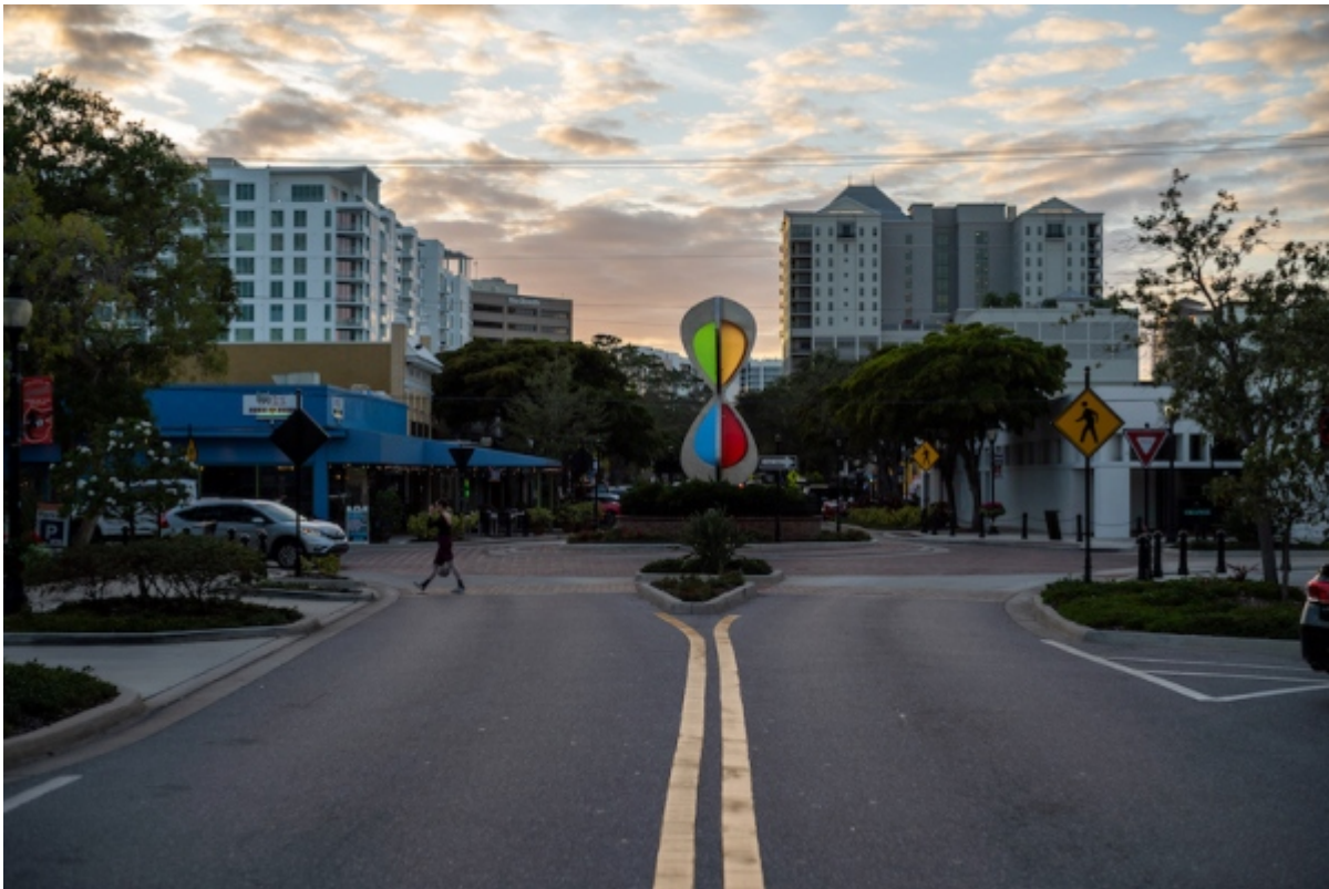
Embracing Our Differences Roundabout at Main Street & Orange Avenue. Photo: