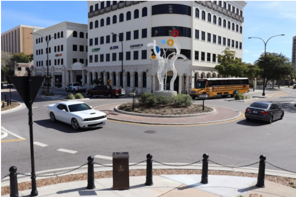
Photo: Bravo! Roundabout at Ringling Boulevard & Orange Avenue.