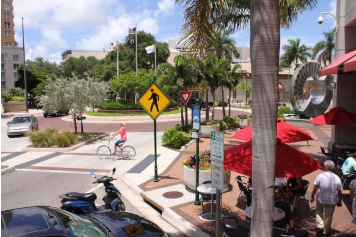
Five Points Roundabout at Main Street & Pineapple Avenue.