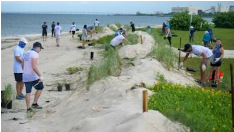
Super Bowl volunteers create sand dunes at Picnic Island Park

"Each year, a symbolic Super Bowl 'Golden Shovel' is passed from one Super Bowl host community to the next. The National Football League, Tampa Bay Super Bowl LV Host Committee, Keep Tampa Bay Beautiful, Tampa Bay Parks and Recreation, Tampa Bay Buccaneers, NFL partner Verizon and Force Blue special operations veterans joined forces for this iconic moment, which is the kickoff for numerous Super Bowl LV community greening projects.