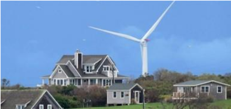
View of wind turbines off Block Island, Rhode Island in 2017