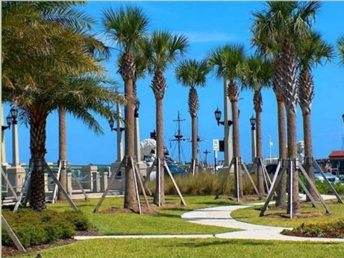
Bridge of Lions Landscape Project