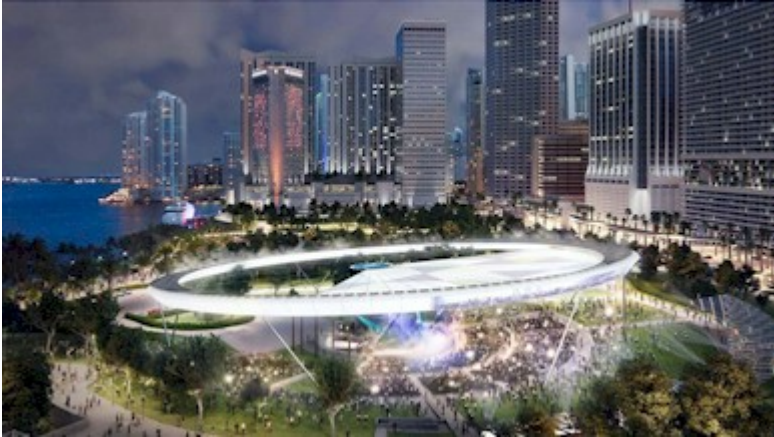
Illustration: A rendering of the solar ring and retractable cover by José Suárez