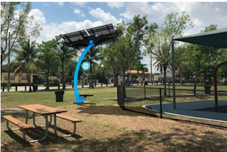
Illustration: A rendering of a solar tree in Bay of Pigs Park from Florida Power & Light